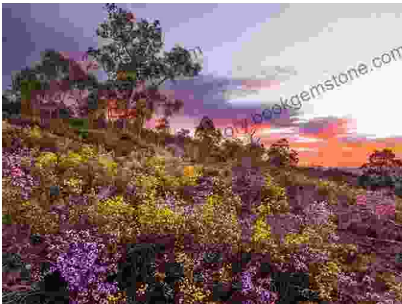
Exploring the Marvels of Wildflowers