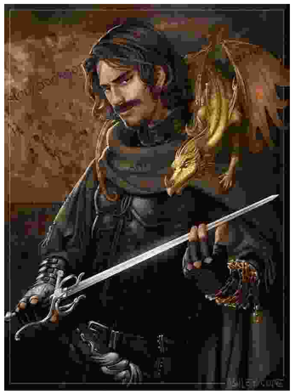
The Dragaeran Tapestry: A Realm of Magic and Intrigue

The Taltos Collections are set in the world of Dragaera, a vibrant fantasy realm teeming with magic and political intrigue. Dragaera is home to a diverse array of races, including humans, Dragaerans, and Trolls, each with their own unique cultures and traditions. At the heart of this complex world lies the city of Jhereg, a sprawling metropolis where power and deception intertwine.