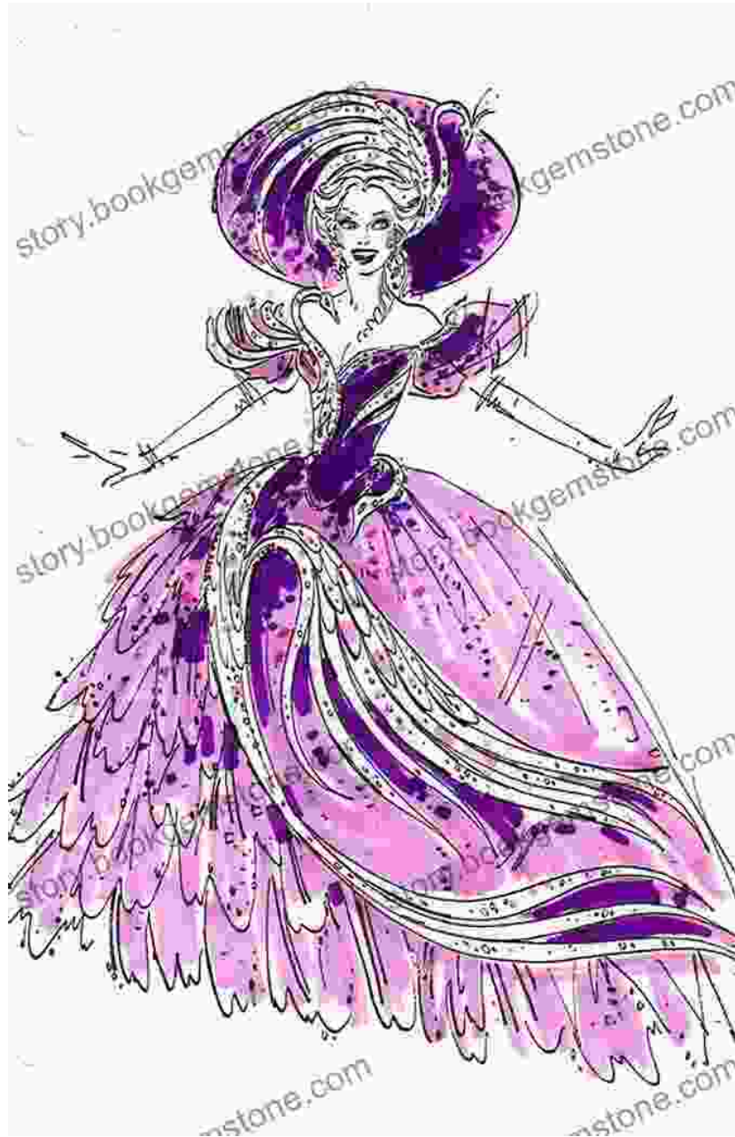
A showgirl costume designed by Bob Mackie, featuring intricate beadwork, feathers, and crystals.

transported audiences to a world of fantasy. Mackie's costumes for films like "The Poseidon Adventure," "The Wiz," and "Barbarella" further cemented his reputation as a master of theatrical illusion, creating characters that were both visually striking and emotionally resonant.