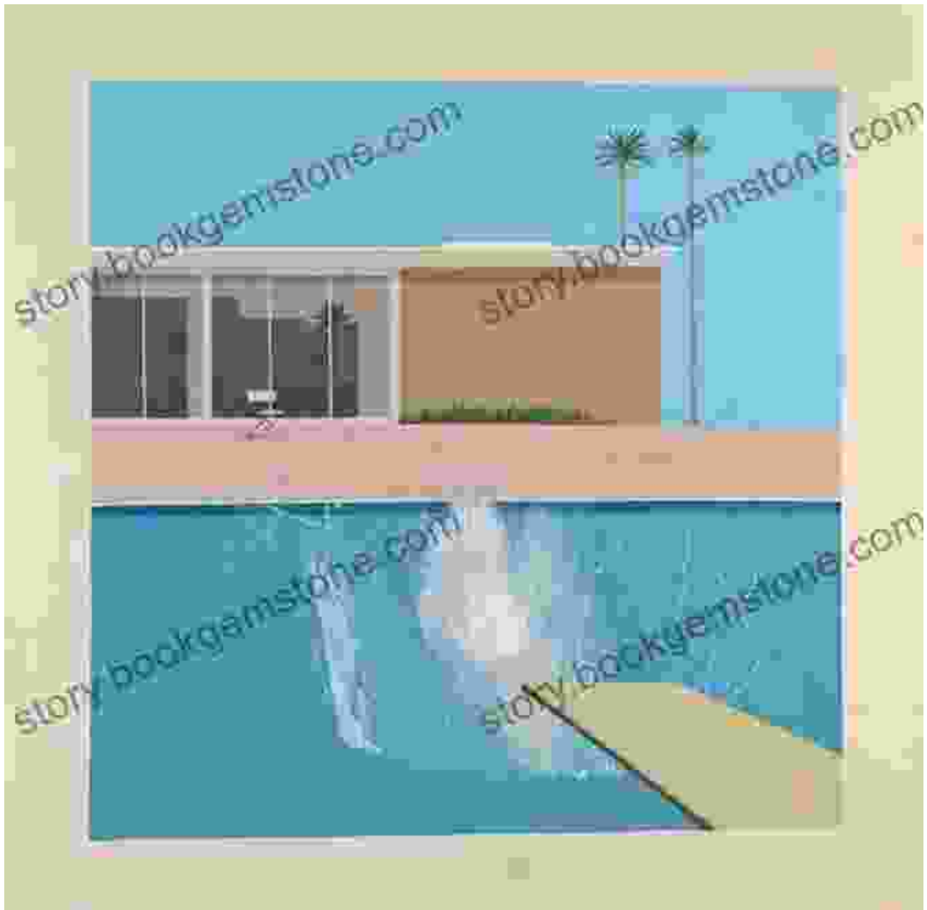
David Hockney, A Bigger Splash , 1967

Hockney's later depictions of Yorkshire are characterized by their brighter colors and more optimistic tone. He often depicts the landscape in a state of flux, with the seasons changing and the weather constantly shifting. These works reflect Hockney's own sense of belonging to the Yorkshire landscape, and they celebrate the beauty and diversity of the region.