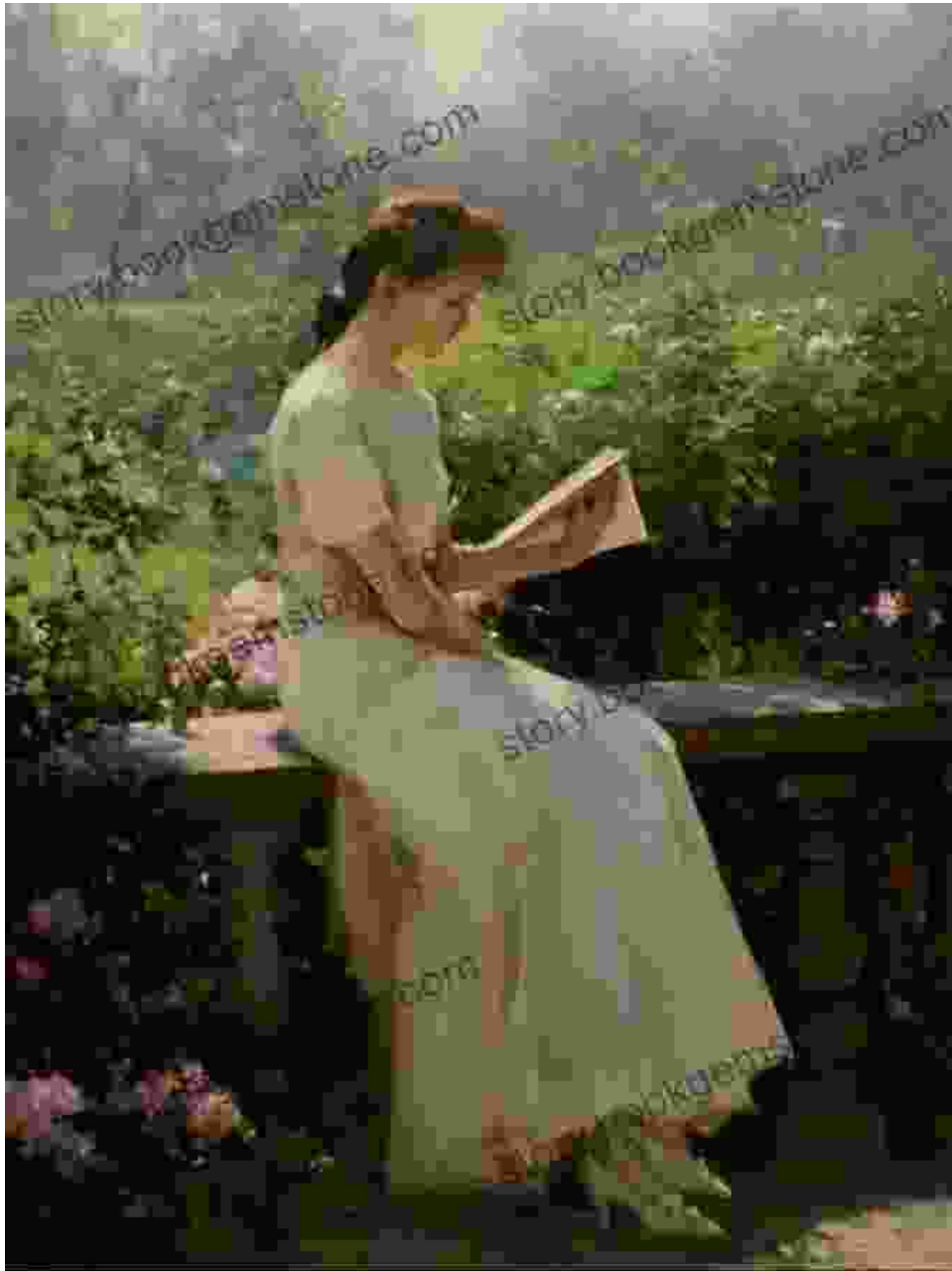
Aleksander Gierymski, "Music" (1885)