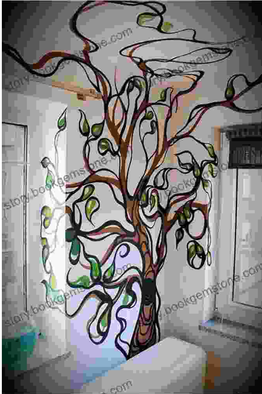
Hand-Painted Wall Art