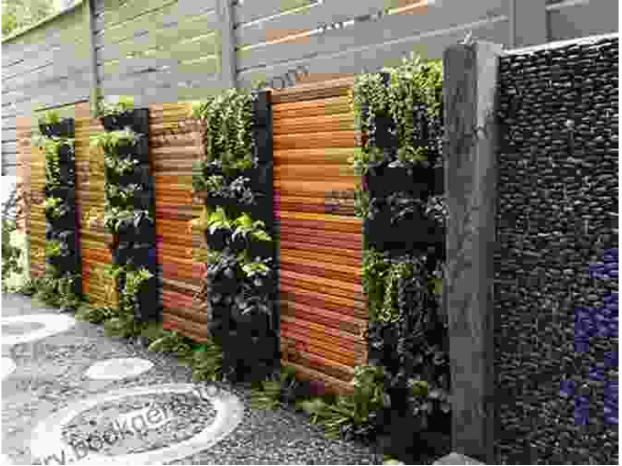
Stenciled Wall Planters